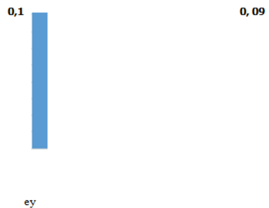
Mg. 2. CO Emissions for various fuels [13,18,19]

CO emission is due to improper combustion of fuel and it mainly depends on many engine temperature, and A/F ratio [13]. Figure 2 explains variation of CO exhaust emissions for various fuels which shows that biodiesel fuelled engine emits less emissions.